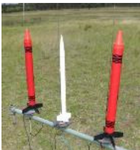
The "Crayons" of Norm and Amos

Some excellent launches today. A moderate southerly wind kept all rockets away from the trees.