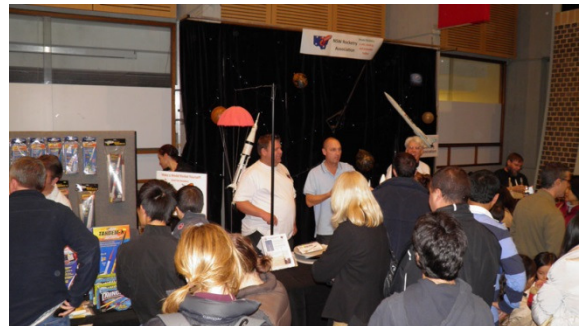
It was a busy night