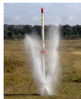
Water certainly comes out of the nozzle fast at 200psi