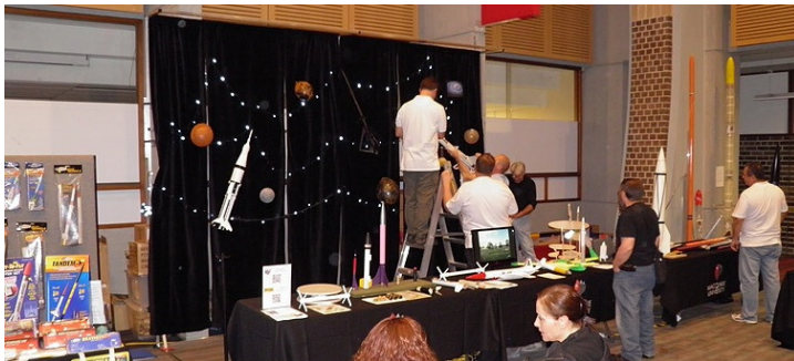
Setting up the display