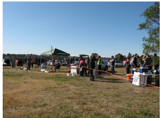
John busy at the BBQ while spectators observe Neville prepping a rocket