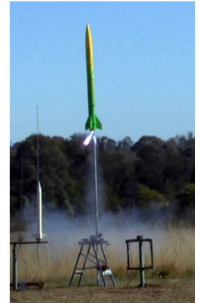
Spencer’s “G-Force” with an unusual motor burn – possibly due to a blocked nozzle or a leak in the aft O-ring

George was examining gravity-activated deployment systems using his water rockets. The results are fascinating - check out the video on youtube: http://www.youtube.com/watch?feature=player_embedded&v=oC8AbWXFITw or on his website: http://www.aircommandrockets.com/day136.htm