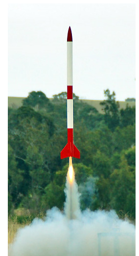
“Ganymede” lifting off on a F40 motor